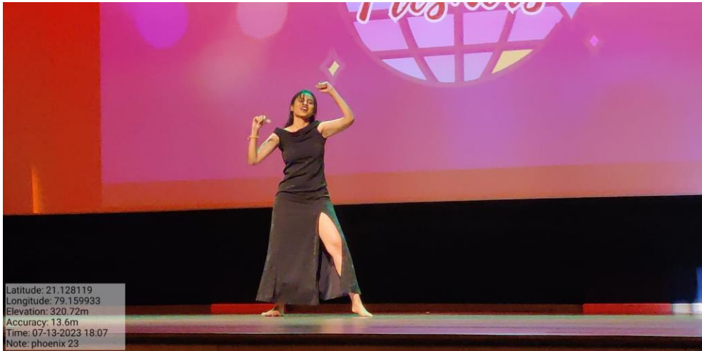
Round 2 (Talent Round)