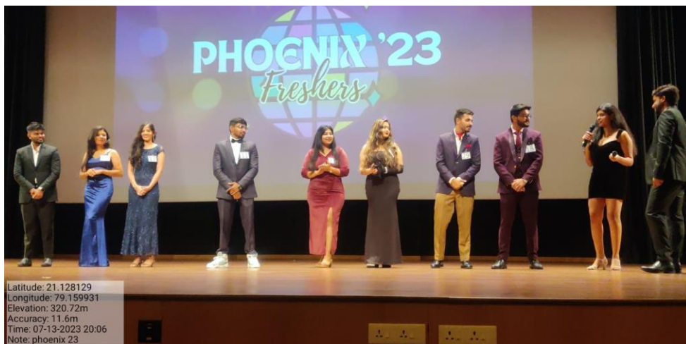
Round 3 (Question and Answer round)